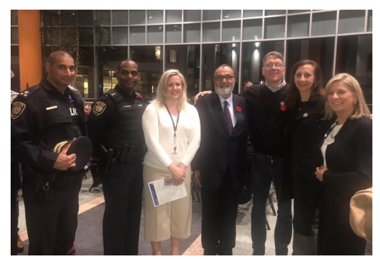
On November 4, members of the Board attended the Crime Prevention Ottawa Awards at Ottawa City Hall.