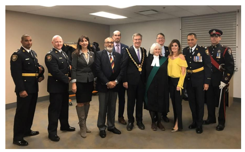
This photo was taken just prior to the start of the Chief's Change of Command Ceremony on November 26 at the EY Centre.